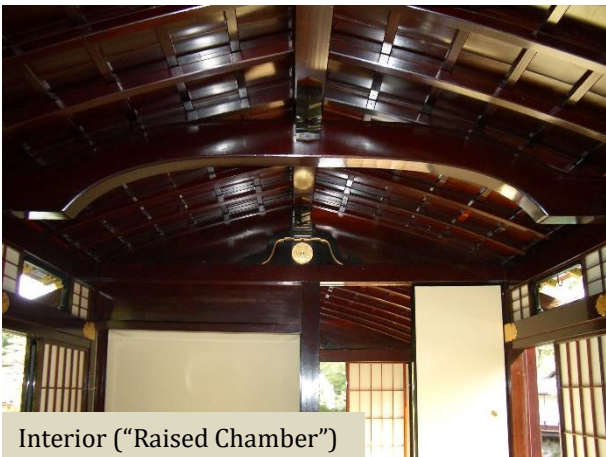
Interior ("Raised Chamber")