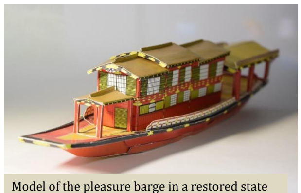
Model of the pleasure barge in a restored state