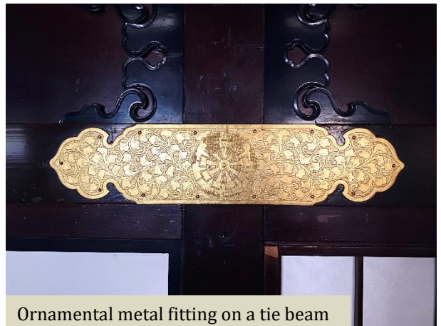
Ornamental metal fitting on a tie beam