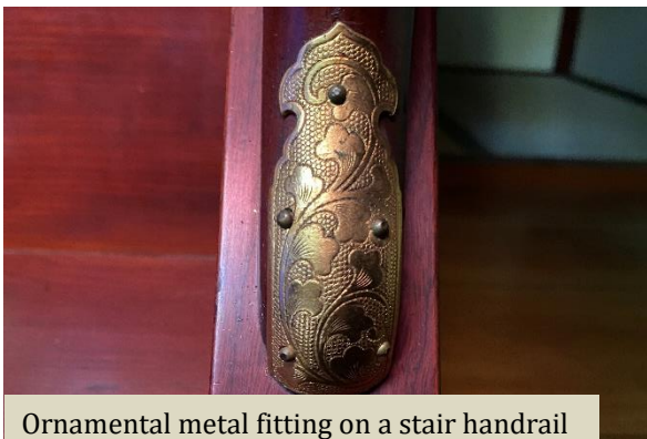
Ornamental metal fitting on a stair handrail