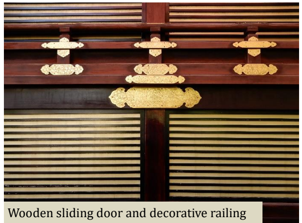
Wooden sliding door and decorative railing