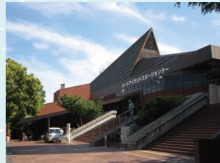
Kobe Port Island Sports Center

Kobe Port Island Sports Center is a full-scale sports facility where sports classes and conventions are held. There is a 25m heated pool and a 50m swimming pool, with a skating facility in the establishment (please check business hours, and be sure to wear a swimming cap before entering the pool and gloves when on the skating rink). The 25m pool can be used throughout the year. A children's pool is also available, so that the whole family can enjoy their time here! Please note that the skating rink is available only in winter, and the 50m pool only during summer. Pre-games training camps for the Olympic Games and Swimming races of the World Masters Games 2021 Kansai will be held at this center.