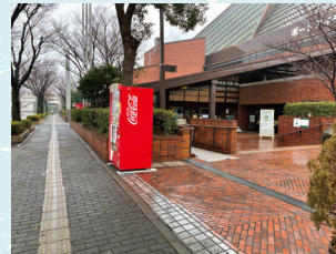
Entrance of the Sports Center