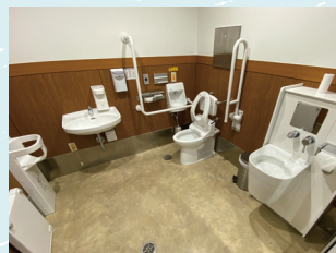
Wheelchair Accessible Restroom

The sidewalk in Port Island Area is developed and is flat. All the stations of the Port Liner trains have wheelchair-accessible restrooms and elevators. There is an overhead walkway extending from south to north through the area. You can use one of elevators installed at several places in order to go up to the walkway. At certain areas along the way, there are tactile pavings for visually impaired persons.