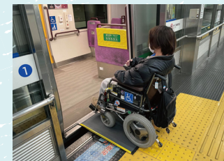
Portable Wheelchair Ramp

■ How to Obtain Discount Tickets To get a discount, show your disability certificate to the station staff. Check the website for more details.