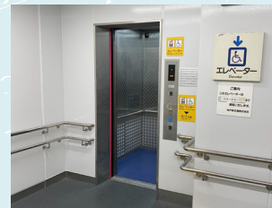
Wheelchair Accessible Elevator

Published in February 2021 Produced by WheelLog Investigated by I-collaboration kobe, KOBE UNIVERSAL TOURISM CENTER