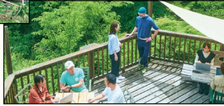
Shared office in the forest