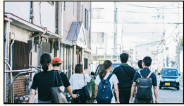
Vacant property tour