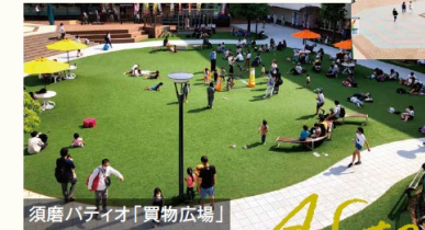
Suma Patio shopping square