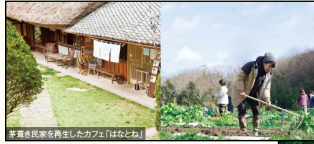
Café in a thatched-roof house, agricultural experience

By going to nature-rich areas like Mt. Rokko and the Seto Inland Sea, you can forget the stresses of everyday life and relax.